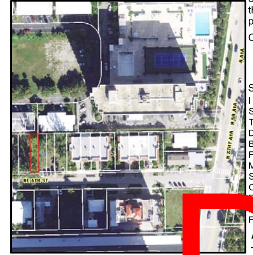
AERIAL MAP (NOT TO SCALE)

FLOOD ZONE INFORMATION Community No. 120055 Panel No. 0377 Suffix: L FIRM Date: 09-11-2009 Flood Zone: AE + 5'